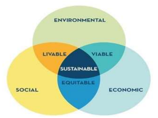
Sustainable development model